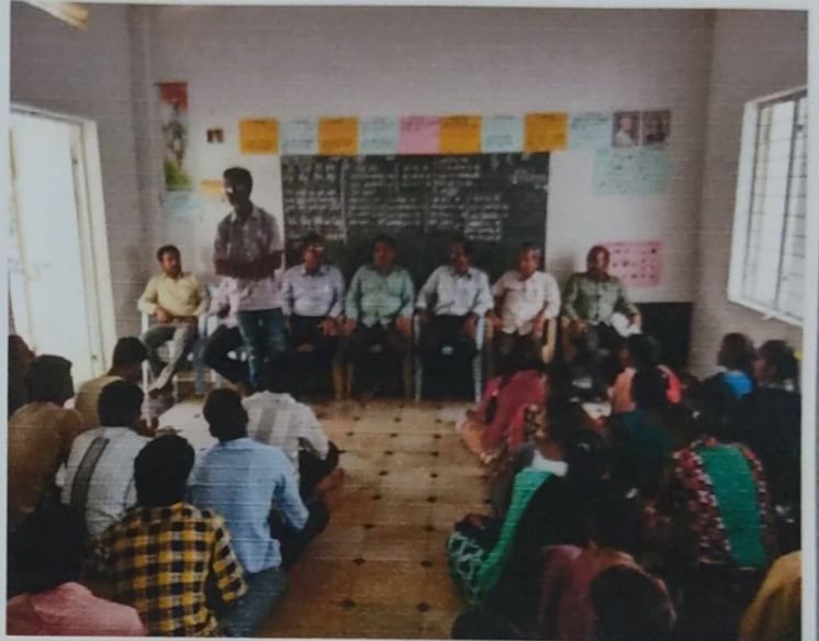
SHARING EXPERIENCE FOR THE STUDENTS