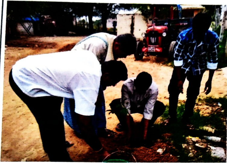
PLANTATION BY PRINCIPAL, MPTC