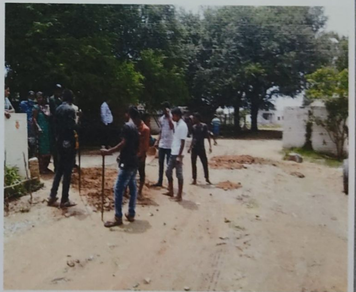
WAYING ROADS AND CLEANING