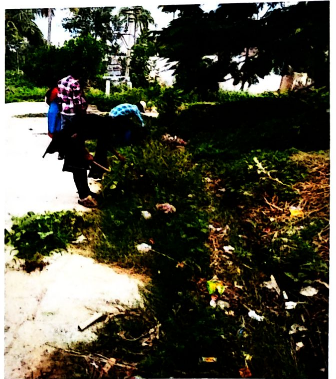
HOSPITAL SAROUNDING CLEANING