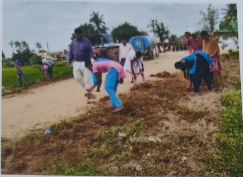
ROAD OUTSIDE CLEANING