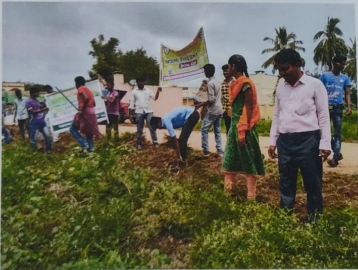
ROAD OUTSIDE CLEANING