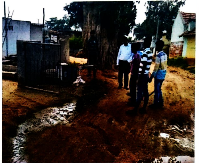
CONTROLLING THE WATER LEKAGE