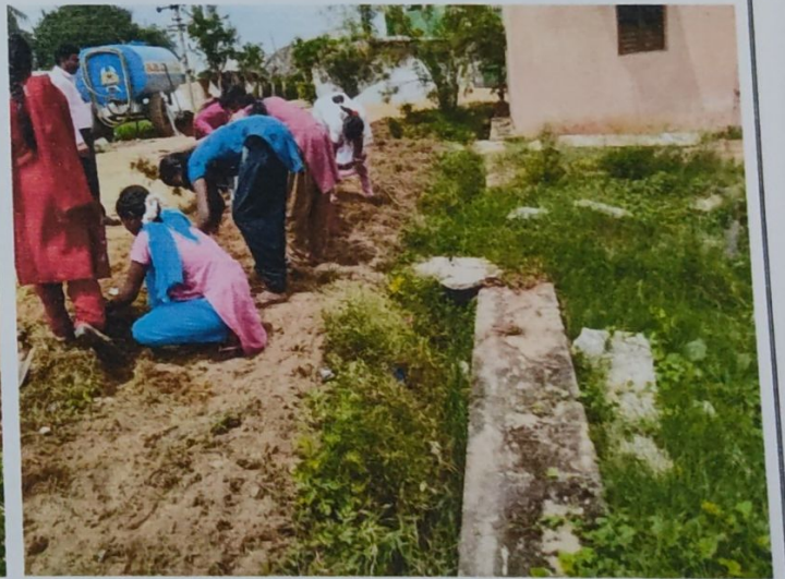
ROAD OUTSIDE CLEANING