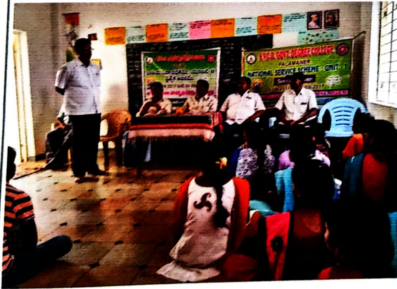
SHARING CAMP EXPERIENCES