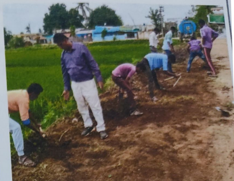
ROAD OUTSIDE CLEANING