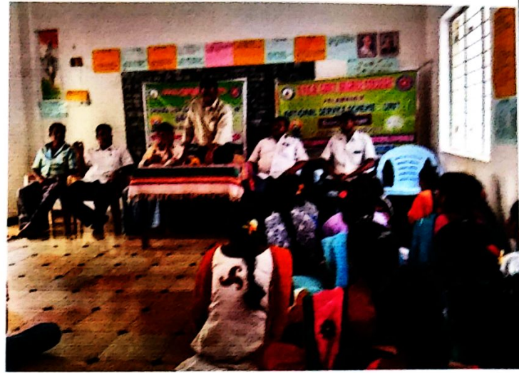
ADDRESSING TO STUDENT BY PRINCIPAL