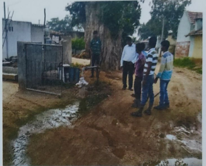
CONTROLLING THE WATER LEKAGE