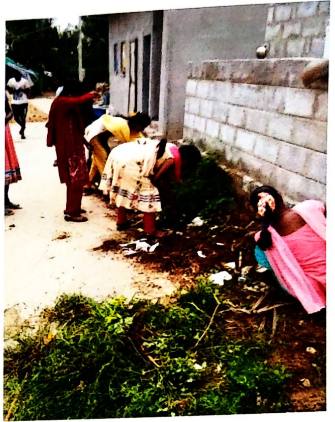
DUST CLEANING IN HOUSES