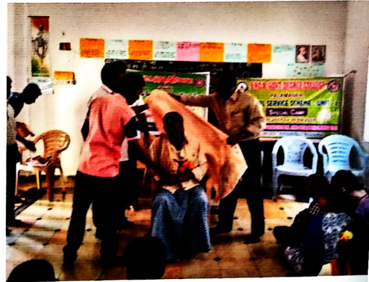
FELECTRION FOR MPTO WITH PRINCIPAL AND STUDENT