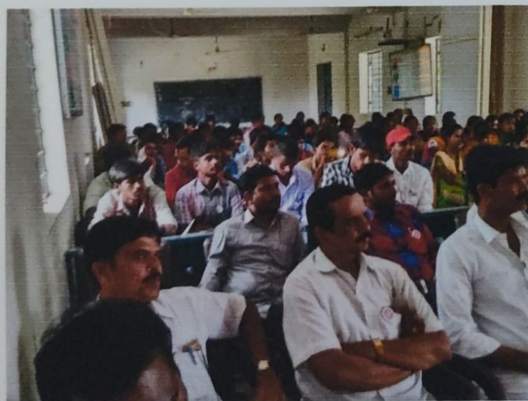
STUDENT AND PUBLIC