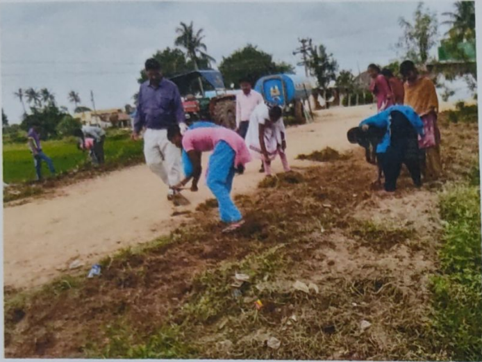
ROAD OUTSIDE CLEANING