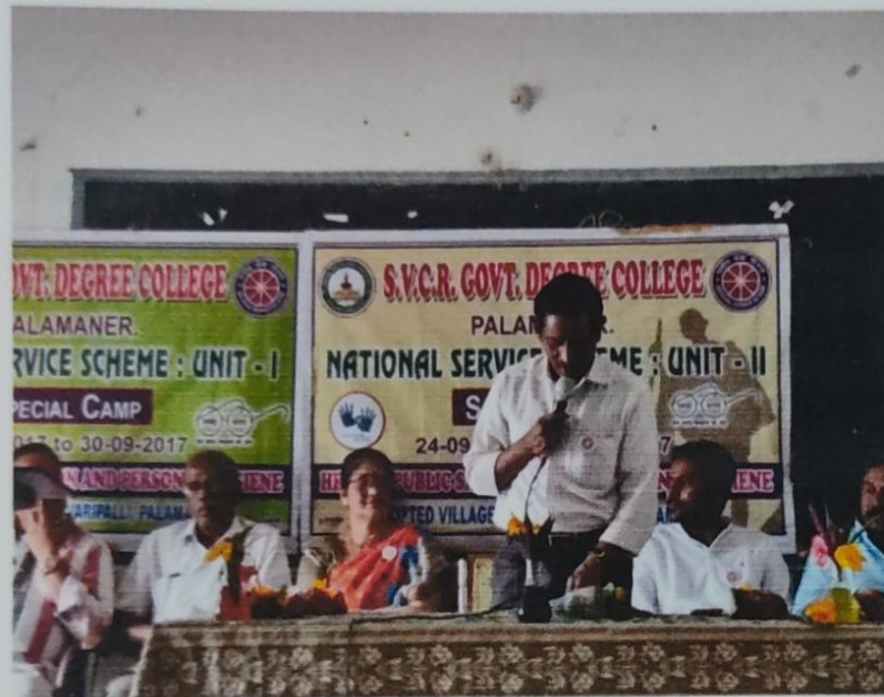
INNAGARATION-ADDRESS BY PRINCIPAL