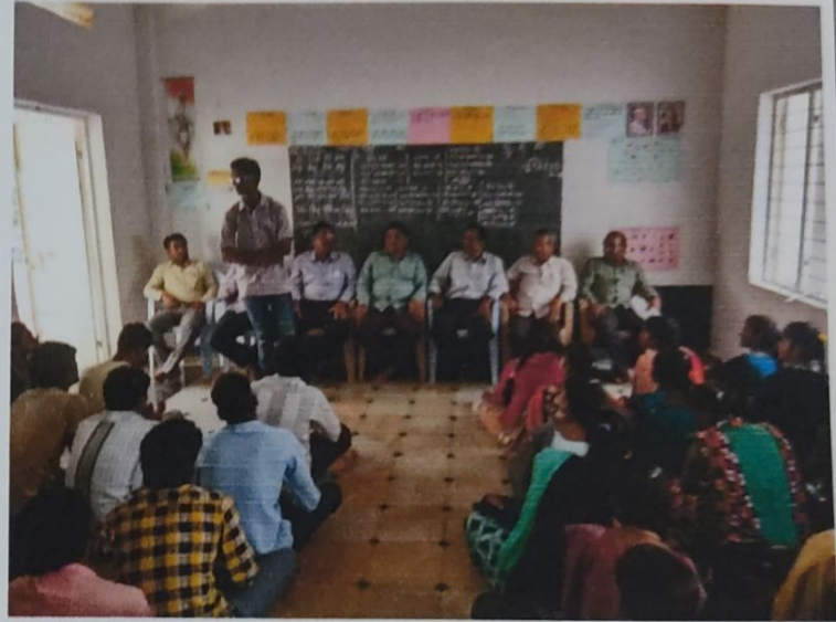
SHARING EXPERIENCE FOR THE STUDENTS