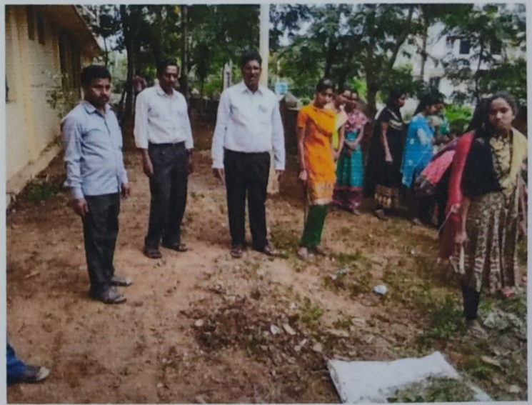
COLLEGE CAMPUS CLEANING