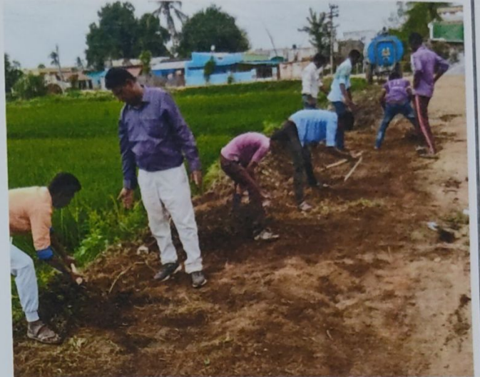
ROAD OUTSIDE CLEANING