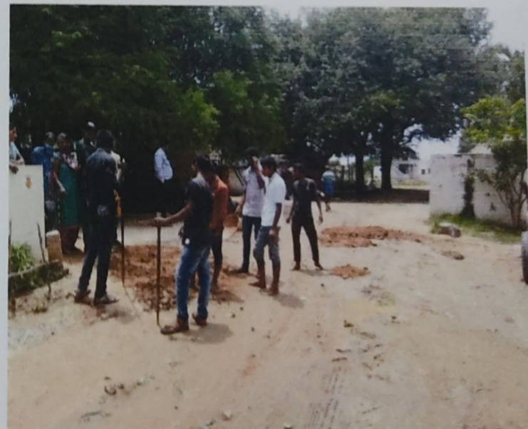
WAYING ROADS AND CLEANING